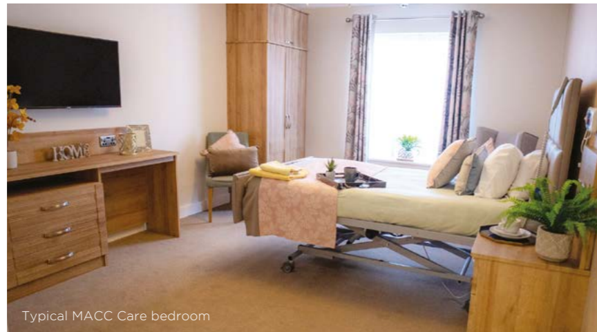
Typical MACC Care bedroom

Church Rose is a cheerful, purpose-built home located within the Handsworth area, providing quality care for up to 48 residents.