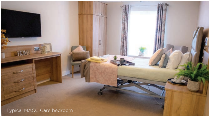
Typical MACC Care bedroom

Homely, established and with many long-standing residents, Priestley Rose in Erdington offers the perfect blend of first-rate care within a warm and welcoming community; one that reflects the diverse culture of its locality.